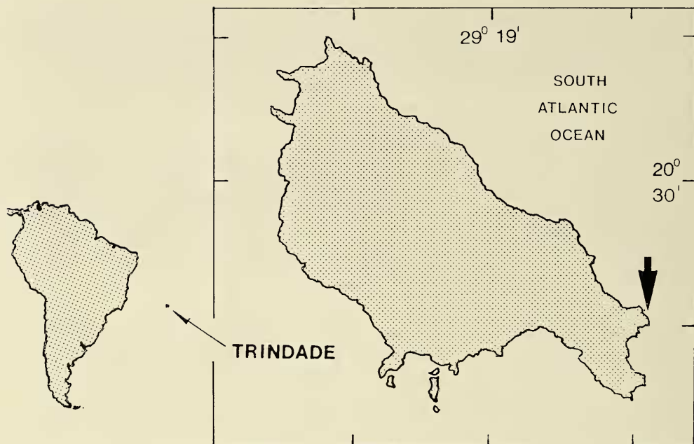
Fig. 1. Location of Trindade Island in the south Atlantic Ocean and of the type locality of Arene boucheti new species in Trindade Island (arrow).

white, 1.5 whorls, 0.25 mm diameter (Fig. 8). Apical surface of protoconch sculptured with 3 fine, well-defined spiral threads. Transition protoconch/teleoconch slightly flared. Teleoconch with 3.25 whorls. Spiral sculpture of five nodulose cords present only after 1.5 teleoconch whorls, 24–32 nodules/cord in final whorl. Adapical cord in each whorl slightly broader than others. Abapical cord in final whorl delimits both periphery and base. Axial sculpture of fine lamellae present over entire teleoconch surface (Fig. 9). Approximately 60 axial lamellae/mm in final whorl. Suture channeled. Base with 4 nodulose spiral cords, third cord wider than other 3, fourth and most abapical cord bordering the umbilicus (Figs. 7, 10). Umbilicus well-defined, deep. Aperture circular, strongly prosocline, thick, with 9 rounded denticles on outer lip, adapical extremity of external lip projecting over base (Fig. 10). Operculum circular, reaching 2.0 mm diameter, multispiral (Figs. 11, 12). Outer surface concave with central depression and about 12 spiral rows of calcareous nodules.